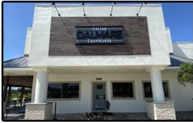
Dal Mare Italian Chophouse