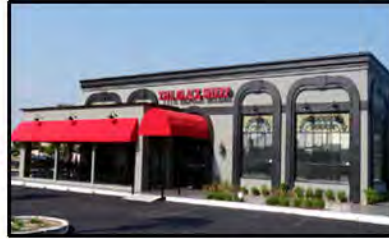
The Black Sheep: a pub & eating house